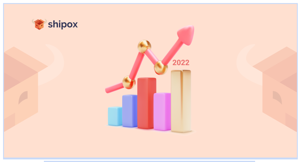
Which Food Delivery Software is Growing in 2022?

The need for <u>food delivery software</u> is increasing as the food delivery industry is rapidly evolving and growing. The latest research shows that there has been a more than 20% growth rate in the online food delivery restaurant industry globally since the last 5 years. The demand and expected growth of the industry definitely varies across different locations, but overall, the total revenue of the industry is expected to become more than $420 billion by the end of 2025. This not only implies massive growth and opportunity to get profits, but it also means that online food deliveries will begin to comprise more than 40% of the total sales of restaurants.